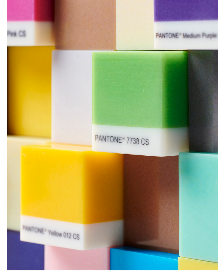
The J850 - with Pantone® Validated color capability.

This color range is made possible because these printers operate with all of the colors in the CMYK color process plus white, enabling a virtually endless palette of shades to choose from. What's more, the printers are PANTONE Validated™, making the PANTONE MATCHING SYSTEM® available