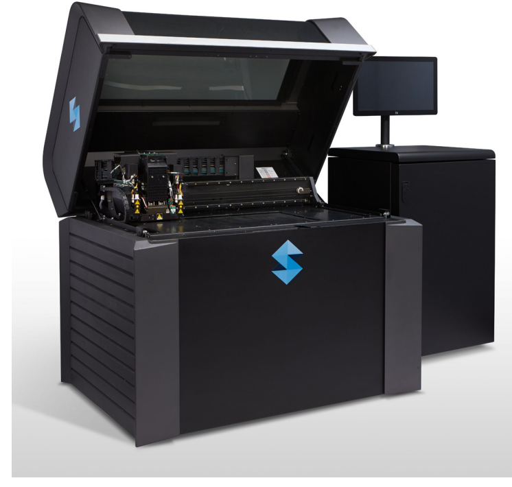
The Stratasys J850.

For a closer look at these printers, visit the J8 Series and the J750 Digital Anatomy pages at Stratasys.com. Then, contact Stratasys when it's time to start the conversation about how this technology can solve your business and educational challenges.