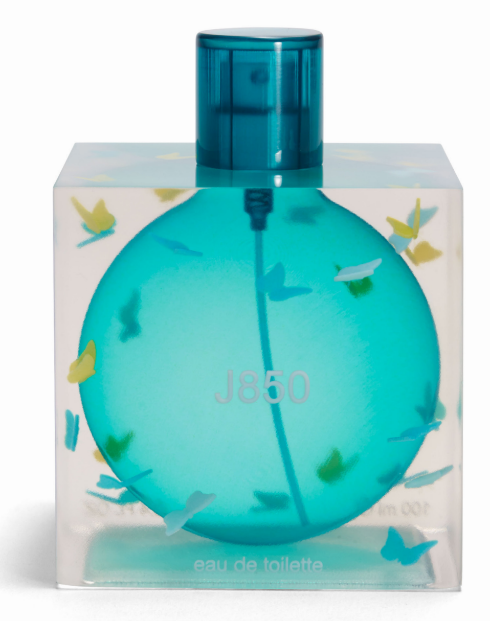
This perfume bottle concept model printed on a J850 combines clear, colored and opaque elements created in a single print.

These are just a few examples of how the J8 Series and J750 Digital Anatomy printers offers solutions to real problems and creates opportunities for improving the status quo in design, medical care and education.