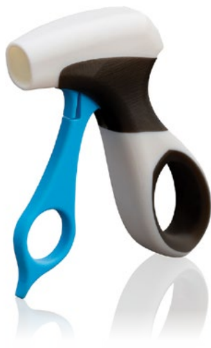
Figure 7. Digital ABS Plus features heavily in this design verification prototype for medical devices. This surgical prototype also features Agilus30 overmolding in black for superior grip and a 3D printed color handle, printed separately. Digital ABS Plus has heightened impact strength from Digital ABS, leading to improved functional performance.

Digital ABS Plus extends the simulation of engineering thermoplastics beyond the thermal resistance, toughness and transparency of High Temperature, Rigid and VeroClear. Digital ABS Plus is an advanced version of Digital ABS™, improving on the original material's impact strength. As its name indicates, this material closely approximates ABS. Compared with the averages for ABS 1 , Digital ABS Plus has the same or higher values for strength, flexibility, durability and heat resistance. Its impact resistance is below average for ABS 1 but still within the range of all ABS offerings, and more than three times that of Vero.