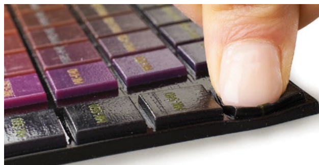
Figure 8. Various colors and Shore A values are displayed on this palette.

This range of rubber-like properties is unrivaled in the 3D printing industry. With it, designers and engineers can match the flexibility of production elastomers or test a number of slightly different options to find just the right feel (Figure 8).