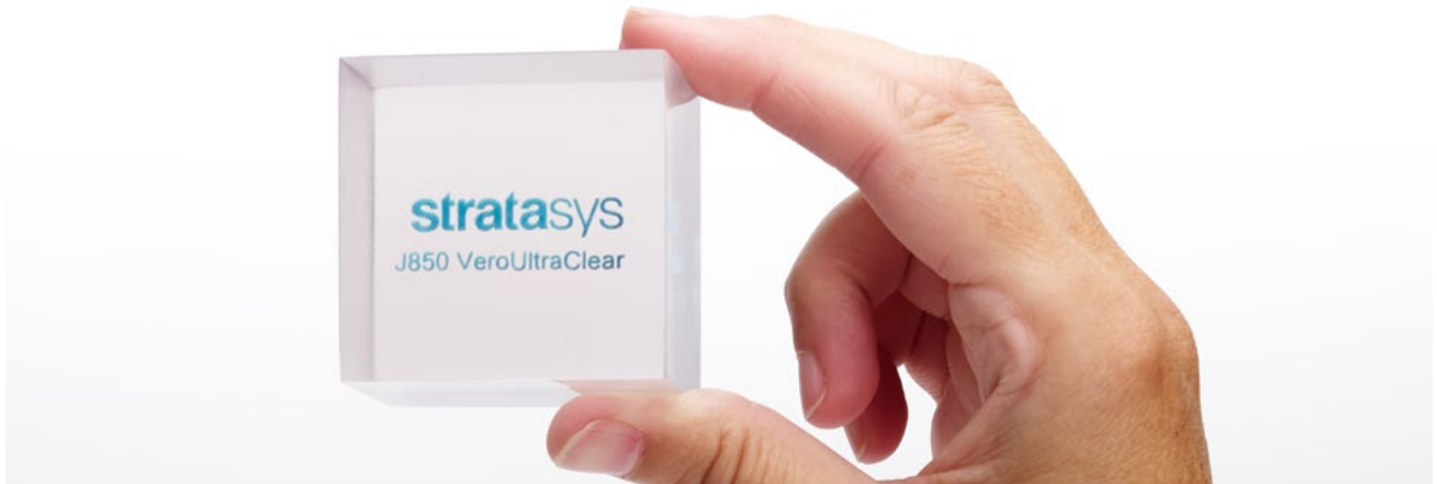
Figure 2. An example of VeroUltraClear material.

PolyJet technology offers three rigid materials that provide either translucency or transparency, RGD720, VeroClear™ and VeroUltraClear™. VeroClear and VeroUltraClear have the same properties as the rest of the Vero family, and RGD720 is also strong and stiff.