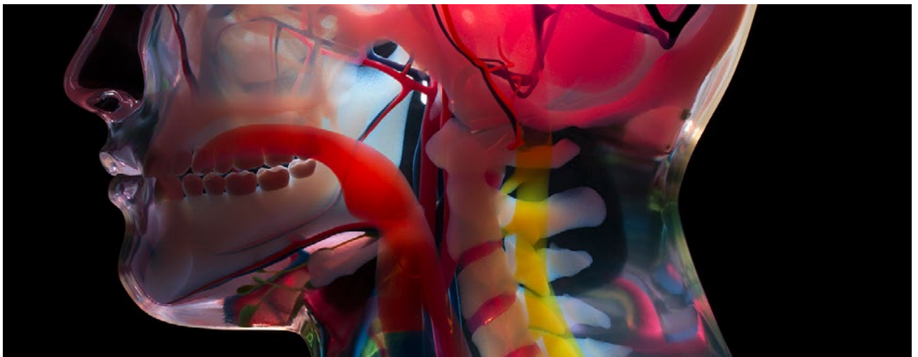
PolyJet's multimaterial capability means it can blend materials to create more than 500,000 distinct material options.

Material options and proven applications in the PolyJet world have expanded greatly in recent years, so it's reasonable to expect a great deal of experimentation among customers. For optimal success, it is important to understand the mechanics and best practices for PolyJet photopolymers and their corresponding 3D printing platforms.