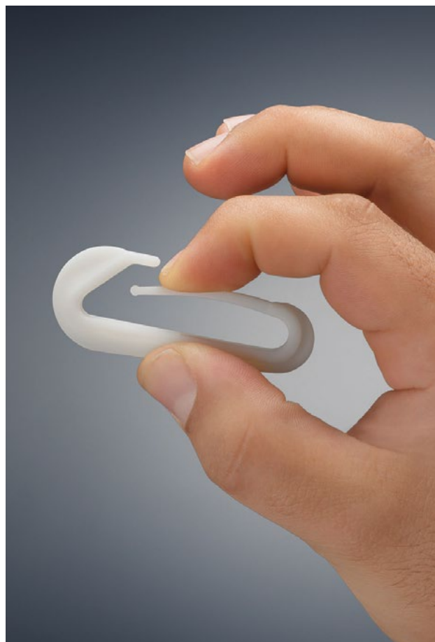
Figure 3. Rigur material was engineered for prototyping polypropylene products.

This PolyJet material has been formulated for improved dimensional and visual characteristics as well as greater strength. Parts made from Rigur are bright white (Figure 3) and have better surface finishes than Durus. This makes Rigur great for visual applications, and its higher temperature resistance (three times that of Durus) and strength (twice that of Durus) make it a good choice for form, fit and light functional testing of parts that will be produced in polypropylene.