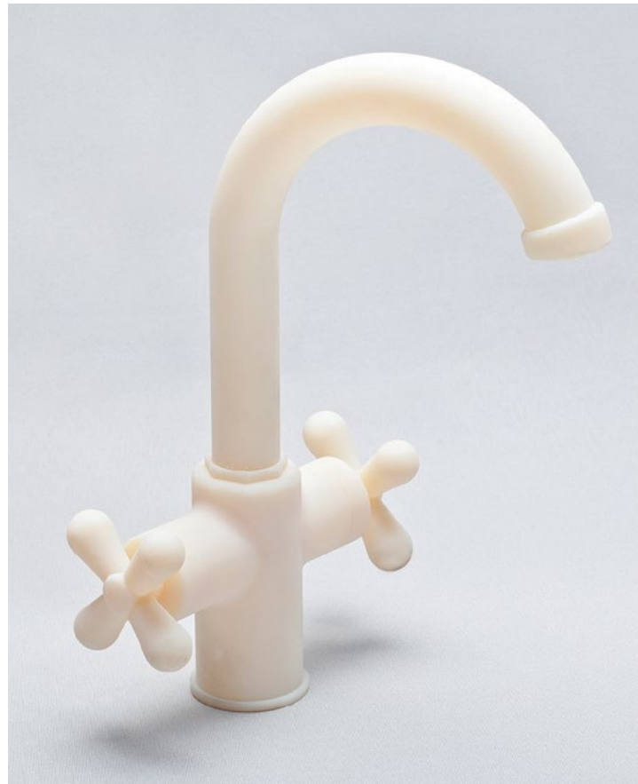
Figure 6. High Temperature material can withstand hot fluids.

High Temperature is a wise choice for functional testing with hot air or water, such as evaluations of plumbing fixtures and household appliances (Figure 6). Temperature resistance may also be a consideration for show pieces that will endure intense, hot lights. If temperature isn't a consideration, High Temperature may be a good choice for prototypes that need very high stiffness and strength.