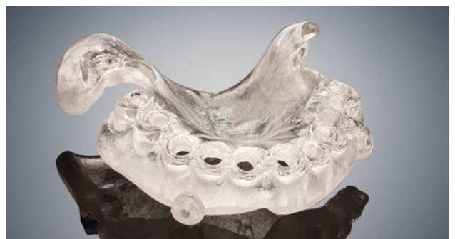
Figure 5. VeroGlaze, left, produces functional dental veneer try-ins, while Biocompatible, right, is approved for direct skin and short-term mucosal-membrane contact.

Biocompatible material is used by both medical and dental professionals when the 3D printed part will have bodily contact. It has five approvals: cytotoxicity, genotoxicity, delayed type hypersensitivity, irritation and USP plastic class VI. With these approvals, biocompatible material can be used for direct skin contact (more than 30 days) and short-term mucosal-membrane contact. Please check each medical material for its specific bio certification.