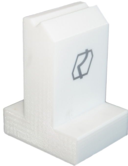
A 3D printed die used for specialized molds that eliminate the risk of unsightly marks on the metal sheets.