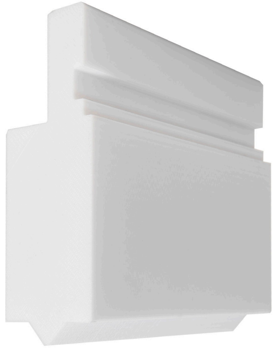
A 3D printed mold designed to produce a V-fold. The mold is currently in use within Rollerri's customer's production floor.

“In addition to supporting the requirements of the customer, we’re getting even more ROI from the Fortus by using it to boost our own internal production efficiencies,” he says. “The clamping systems are a prime example. Previously, we would outsource these tools to be machined, which is costly and requires long lead times. When we needed to modify the design, we had to go through the same costly cycle again. With our 3D printer, we can iterate the design of the mold as much as we want and 3D print them on-demand, which has transformed the way our operators work and given them the confidence to be creative with their tool design.”