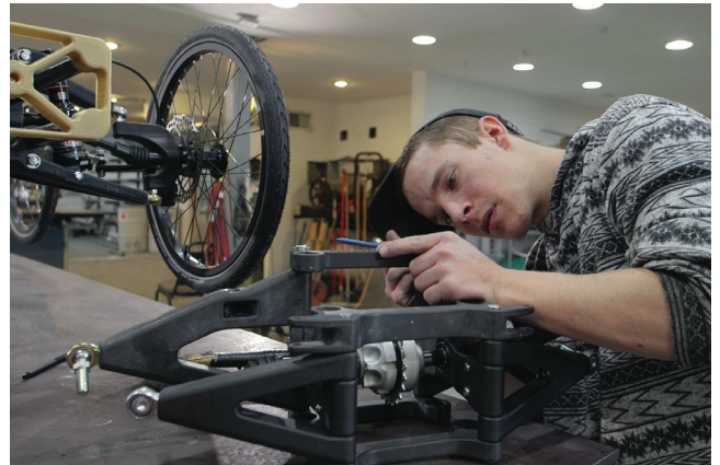
The ability to use Stratasys FDM Nylon 12CF in all stages of the manufacturing process is a game-changer for Utah Trikes.