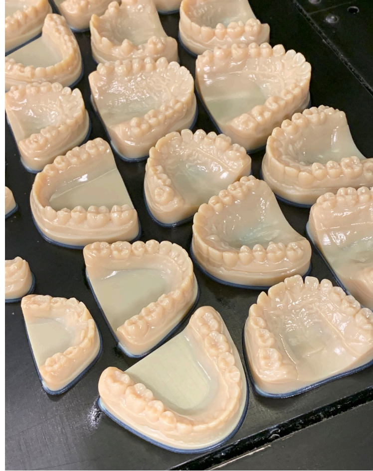
Completed 3D print with Separator DM

In addition to saving time, the easy separation also helps NEO to increase accuracy. For example, a tech would struggle when prying the acrylic up on a retainer using standard separator. And the wires might have flared up, which would then need to be bent back to the original shape. But with Separator DM, the acrylic easily pops off the model, so the wires stay in place leaving the device highly accurate.